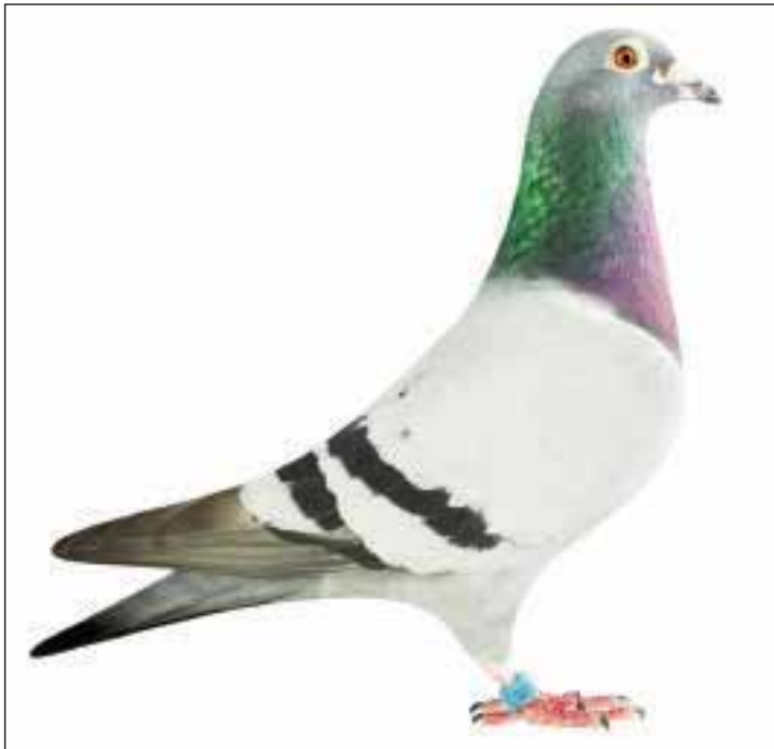
'Zoon Jonge Beer'.

NL16-1408373 'Zoon Jonge Beer': 5th pigeon champion one day long distance district 4 Prov 6, 13th pigeon champion one day