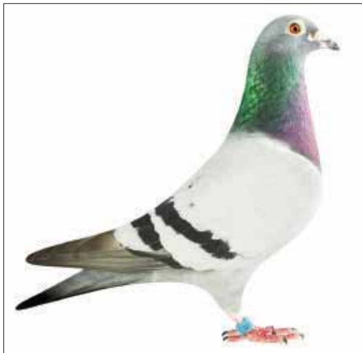
'Zoon Jonge Beer'.

5th pigeon champion one day long distance District 4 Province 6, 13th pigeon champion one day long distance Fondclub NH, 5th pigeon champion one day long distance Prov 6 District 4 ZCC.