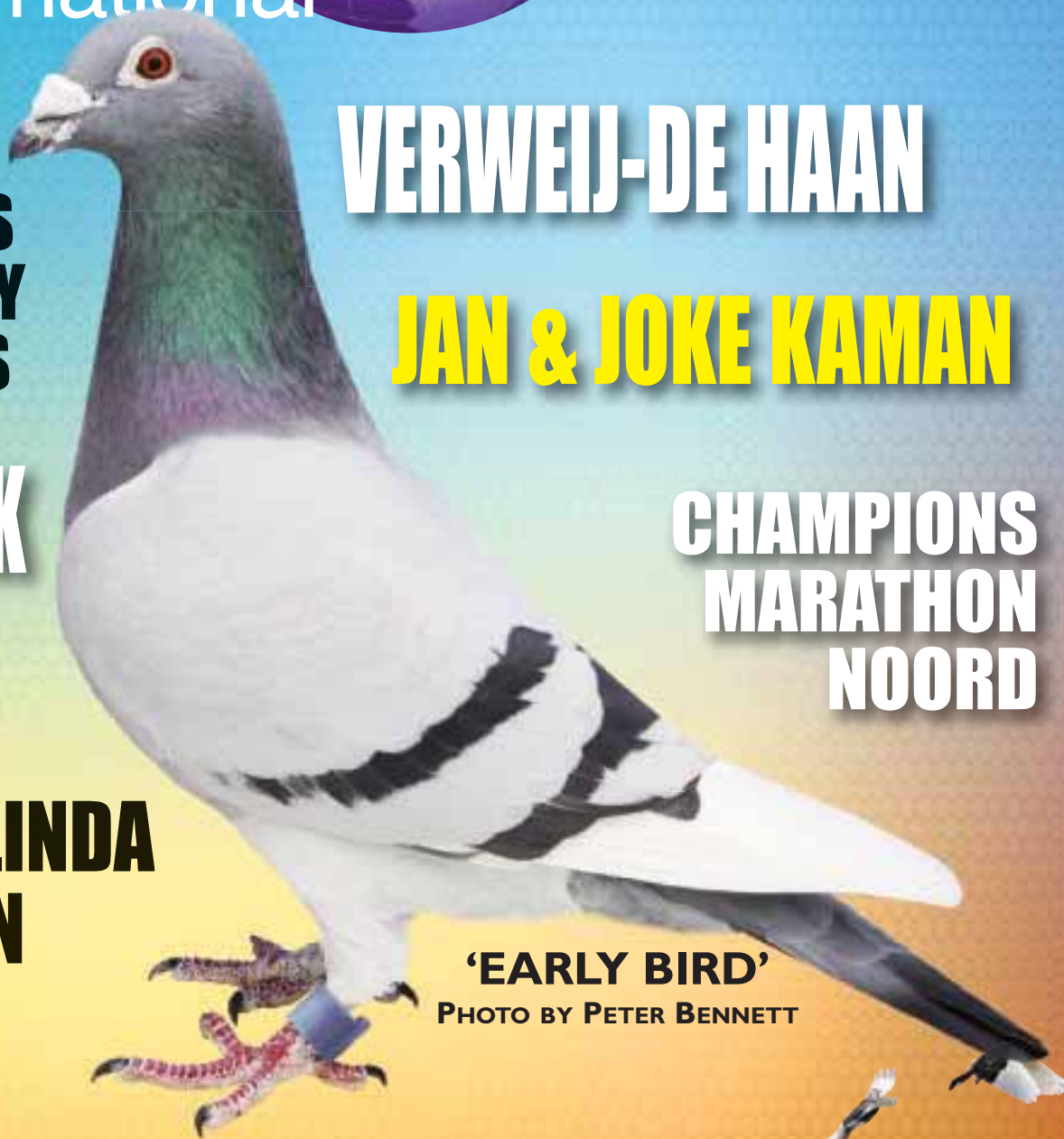
'EARLY BIRD'